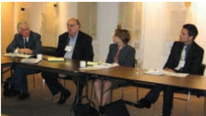
Participants exchange ideas during the Forum's North American Global Dialogue roundtable on Local Government and Metropolitan Regions held in Chicago in January 2007.

Local government in the United States will need to adapt to meet the challenges of regionalism, the global economy, climate change and homeland security. This was the conclusion stressed by academics and government officials meeting in Chicago for a one-day conference on Local Government and Metropolitan Regions. The event, held on Jan. 18, 2007, was part of the Forum's Global Dialogue on Federalism, which is examining the issues of local government in 12 federal countries around the world.