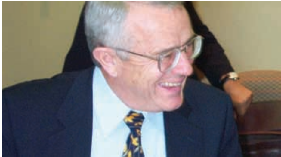
Arnold Koller, Chairman of the Forum's Board of Directors.

As chairman of the Forum of Federations I am honoured to present you with the organization's annual report for 2006–2007.