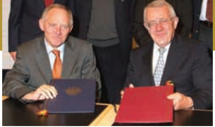
German Interior Minister Wolfgang Schäuble (left) presents Forum Chairman Arnold Koller with a letter of intent for Germany to join the Forum.