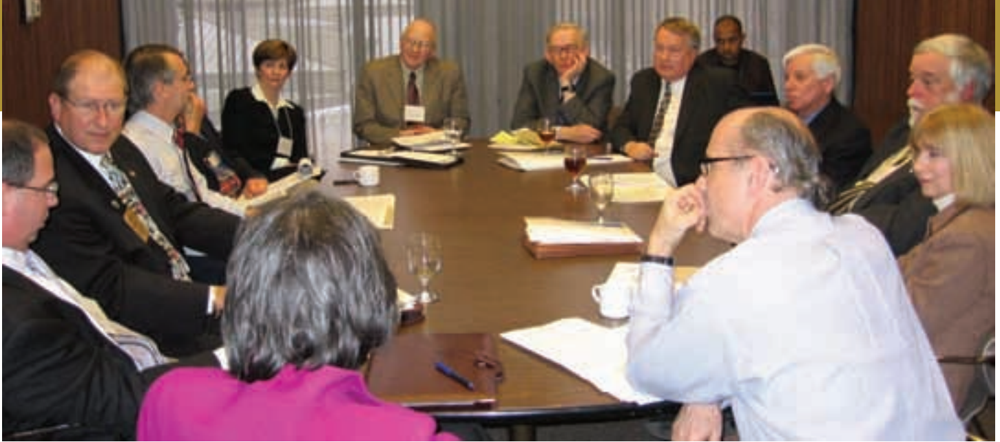
U.S. officials discuss municipal finance at a Global Dialogue roundtable on local government, January 2007, in Chicago.