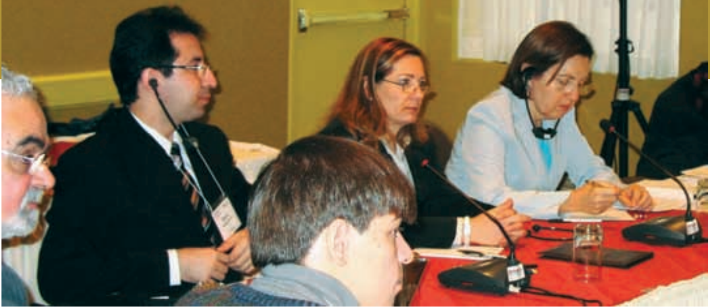
Brazilian finance officials learn about Canada in a study tour, December 2006.