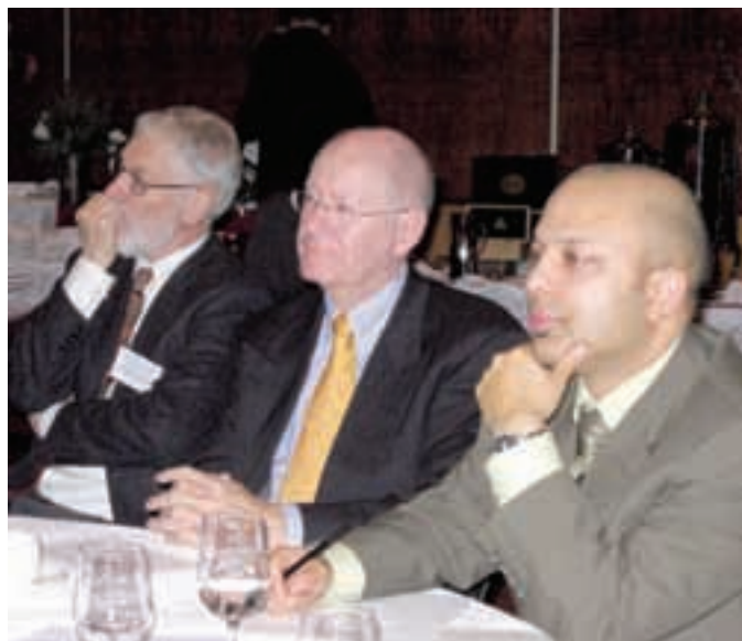
Participants learn from the experiences of various federations at the Conference on Post-Secondary Education in Federal Countries in Gatineau, Canada, January 2007.

With funding from the Canadian International Development Agency, the DVD is to be used to train about 70 Iraqi academics, and will form part of the curriculum for a course on federalism for law and political science students in Iraq's publicly-funded universities. There are 20 law colleges and six departments of political science in Iraq. The 42-minute DVD contains Arabic, Sorani-Kurdish and English versions. It is also available in French, Tamil and Sinhala.