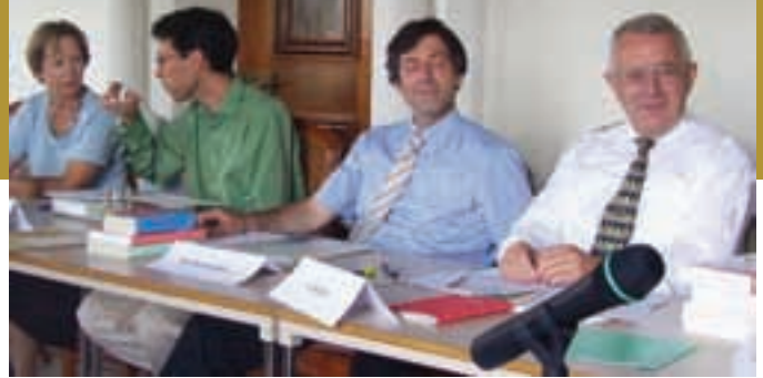
Prof. Arnold Koller (at right) with participants of the Swiss Global Dialogue roundtable held in Zurich in June 2006.

Members of the Spanish parliament joined participants from the regions of Spain and local municipalities in Madrid to discuss how local governments fit in the Spanish governmental system. The event, the Spanish Global Dialogue roundtable in the Forum's series on Local Governments and Metropolitan Regions, was held on Jan. 26, 2007.