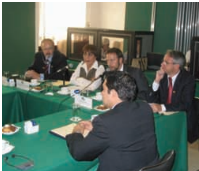
Participants discuss intergovernmental coordination and public safety in federal systems at a roundtable organized by the Forum and Mexico's National Institute for Federalism and Municipal Development in March 2007.

The Forum is assisting Mexico's National Institute for Federalism and Municipal Development and the Organization of American States (OAS) in organizing the second thematic meeting of the federal countries of the OAS high-level Network on Decentralization. It is known by its Spanish acronym RIAD. The meeting is scheduled for September 2007.