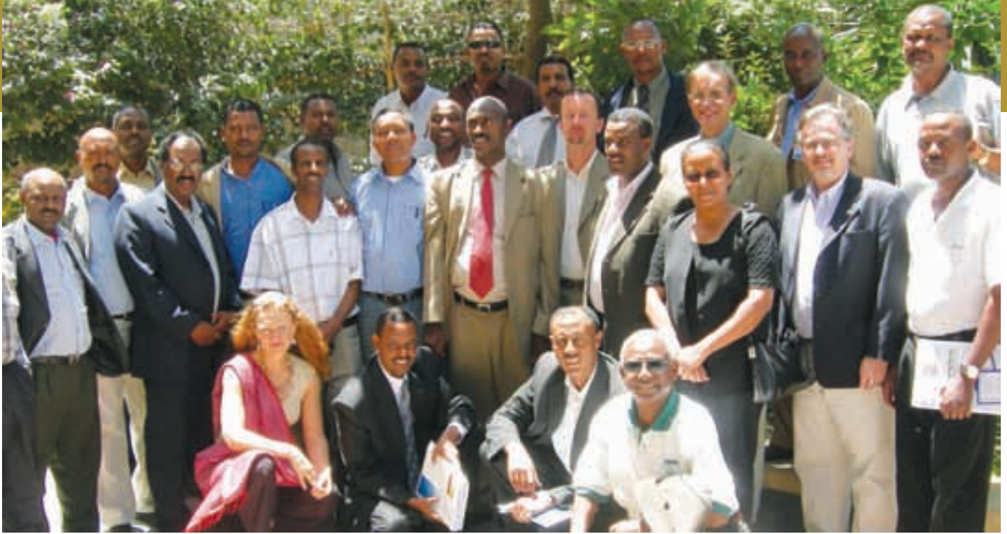
Ethiopian participants met for a three-day workshop on intergovernmental relations in Addis Ababa, March 2007.

Governance programs bring together practitioners of federalism to learn and share from the experiences of their counterparts in other federal countries.