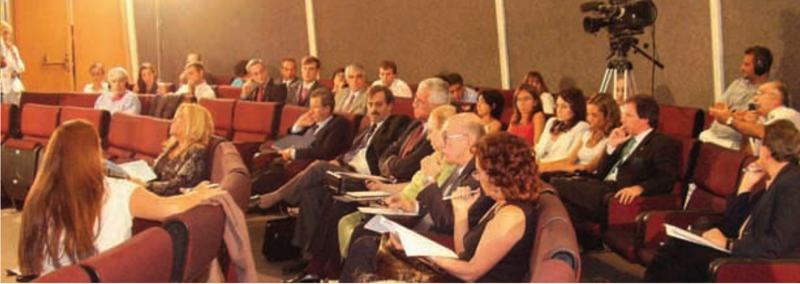
Argentine senators and academics discuss fiscal reform, with Forum participation, in the Senate of Argentina, Buenos Aires, March 2007.