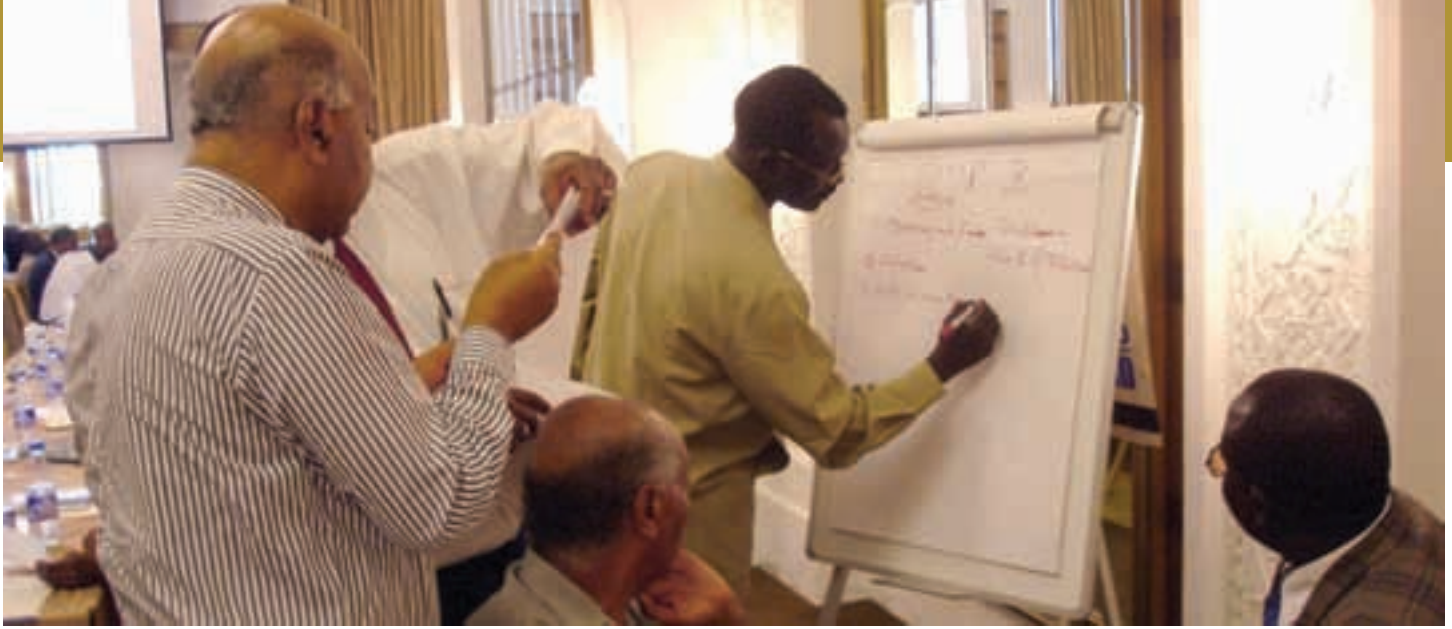
Participants explore priorities for federalism during a training session in Khartoum, Sudan.