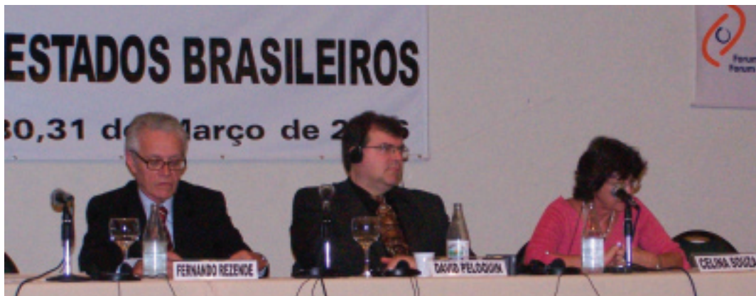
Workshop on fiscal harmonization in Foz do Iguaçu, Brazil, March 2006