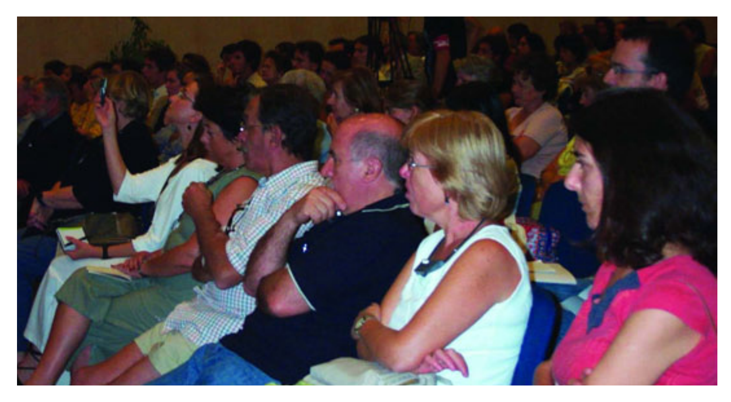
Hundreds from across Europe and beyond heard Forum speakers at the Global Dialogues on Democracy and Diversity conference in Spain in September 2004.

Following a meeting between the Forum president and the minister of justice of Catalonia in March in Brussels, it was agreed that the Forum and the Institute for Autonomous Studies (a Forum liaison partner linked to the Catalan government) would co-organize a roundtable on intergovernmental co-operation with the national government and as many as possible autonomous communities. This event would be held in the spring 2006 in Barcelona or Madrid, Spain.