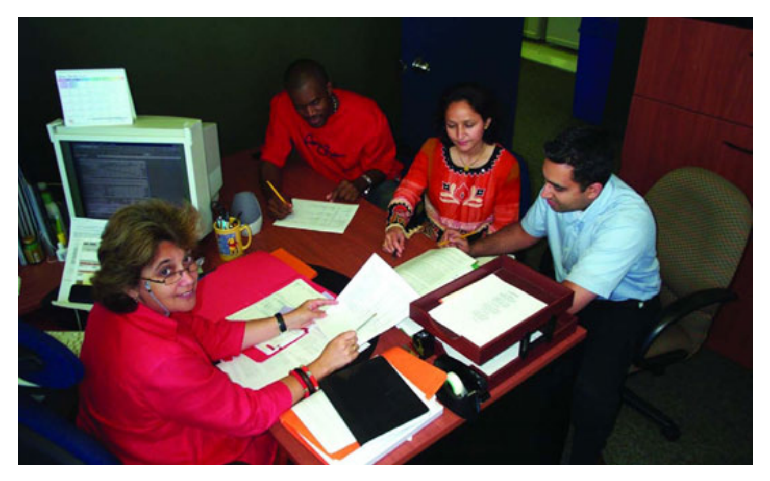
Forum staff from finance, systems and operations here check project budgets. The division is also responsible for phone lines, the Forum's internet and intranet services and administrative support.

In 2004–2005, a five-year strategic operational and financial plan was developed with active participation and contribution of staff, board members and associates. This plan was instrumental in securing the support of partner governments and will guide the Forum in addressing its mandate over the next five years.